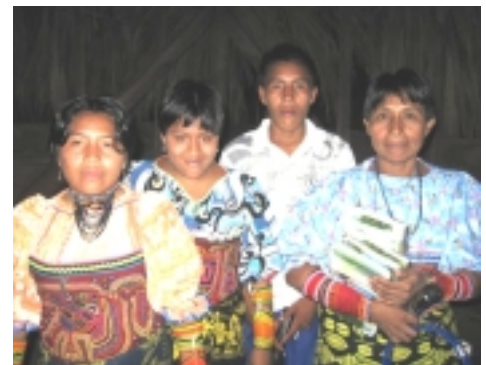
Our Panama team asked for prayer specifically for these believers in Diwarsikua